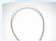
Nitinol core 1:1 Torque and steerability Kink-resistant